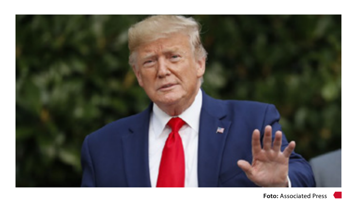
Trump to tell Pelosi that White House won't cooperate on impeachment until

One important detail remained, is that nobody, and including the station's longtime owner or the Electric Vehicle Institute was entirely sure what to call a gas station that doesn't offer gas anymore. The charging station is as much a social experimentation as it is economic, but if it gets successful it could provide a model for replication elsewhere.