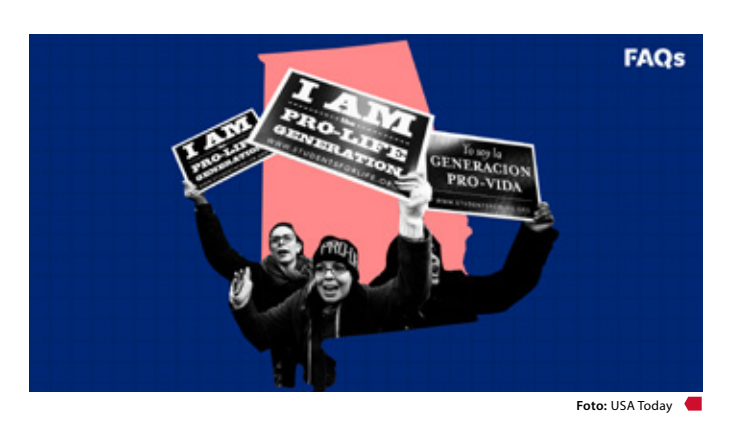
Supreme Court agrees to rule on abortion restrictions, setting up contentious election year debate

Is import to mention that the U.S economy added 136,000 jobs in September, and the jobless rate dropped to 3.5% in September from 3.7% in August, marking the lowest jobless rate since December 1969, when it also logged in at 3.5%.