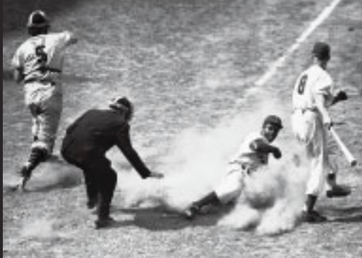
Jackie Robinson, sliding home in a 1948 baseball game. Robinson broke the color barrier against black professional baseball players when he joined the Brooklyn Dodgers and became one of the stars of the game.