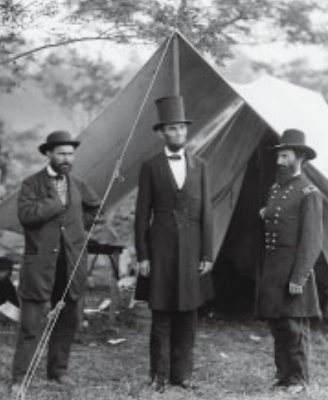
President Abraham Lincoln (center), at a Union Army encampment in October 1862, following the battle of Antietam.