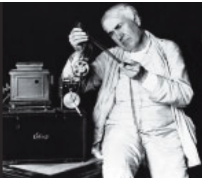
Thomas Edison examines film used in the motion picture projector that he invented with George Eastman.