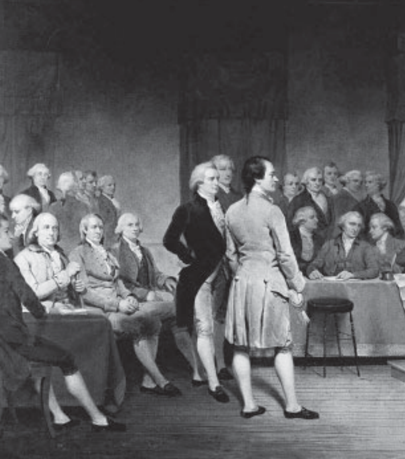
George Washington addressing the Constitutional Convention in Philadelphia, 1787.