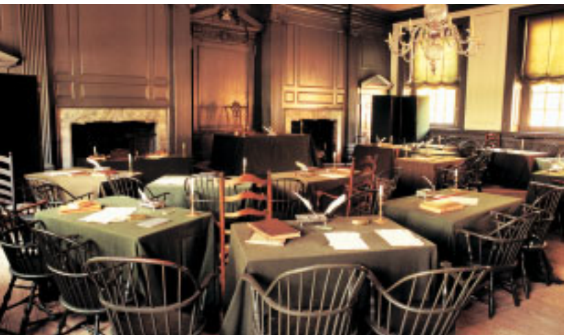
The historic room in Independence Hall, Philadelphia, where delegates drafted the Constitution of the United States in the summer of 1787. The Constitution is the supreme law of the land.

The gathering in Philadelphia in May 1787 was remarkable. The 55 delegates elected to the convention had experience