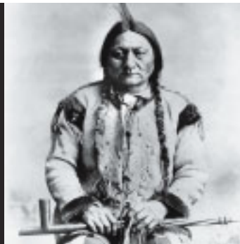
Sitting Bull, Sioux chief who led the last great battle of the Plains Indians against the U.S. Army, defeating General George Custer at the Battle of Little Bighorn in 1876.

The western region of the United States continued to attract settlers. Miners staked claims in the ore-rich mountains,