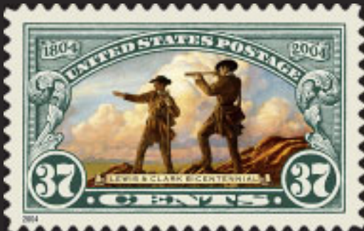
U.S. postage stamp commemorating the bicentennial of the Lewis and Clark expedition under President Thomas Jefferson. Their expedition mapped western land all the way to Oregon for the young United States.