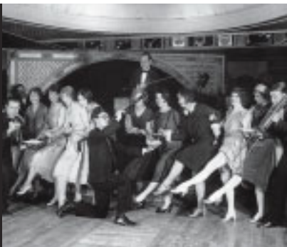
Flappers posing for the camera at a 1920s-era party.