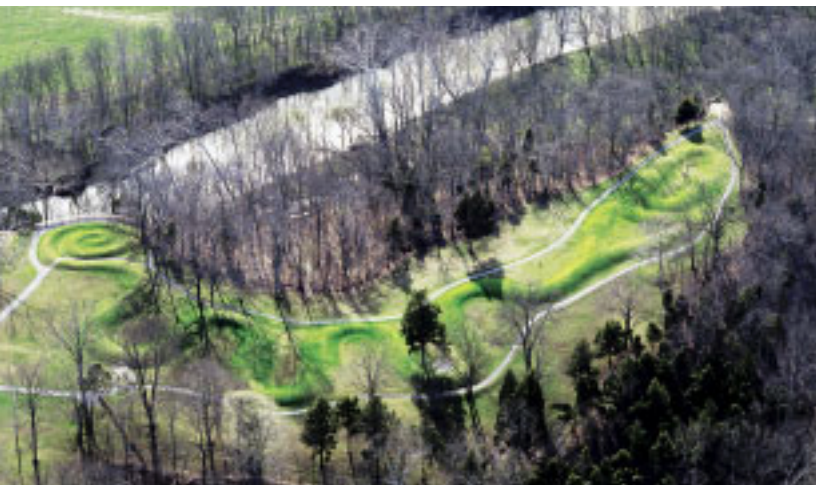
Left, Mesa Verde settlement in Colorado, 13th century. Above, aerial view of the Great Serpent Mound in Adams County, Ohio. Carbon tests of the effigy revealed that the creators of this 1,330-foot monument were members of the Native-American Fort Ancient Culture (A.D. 1000-1550).

These early groups are known as Hohokam, Adenans, Hopewellians, and Anasazi. They built villages and grew crops. Some built mounds of earth in the shapes of pyramids, birds, or serpents. Their life was closely tied to the land, and their society was clan-oriented and communal. Elements of the natural world played an essential part in their spiritual beliefs. Their