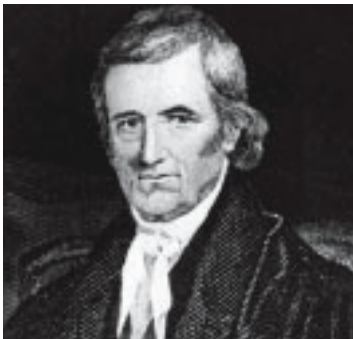
John Marshall, chief justice of the U.S. Supreme Court from 1801 to 1835, in a portrait by Alonzo Chappel.