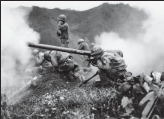
U.S. infantry fire against North Korean forces invading South Korea in 1951, in a conflict that lasted three painful years.