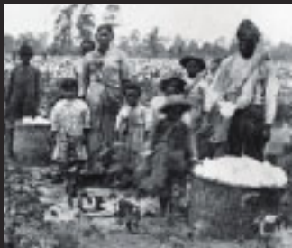
Slave family picking cotton near Savannah, Georgia, in the early 1860s.