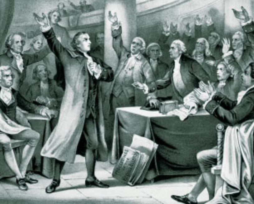
Drawing of revolutionary firebrand Patrick Henry (standing to the left) uttering perhaps the most famous words of the American Revolution — “Give me liberty or give me death!” — in a debate before the Virginia Assembly in 1775.