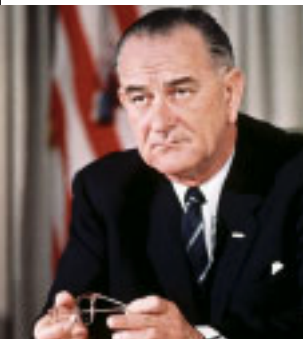
President Lyndon B. Johnson engineered the most ambitious domestic legislative agenda through Congress since Roosevelt's New Deal.

The great social changes of the 1950s-1980s grew out of an open, fluid, and diverse society. Demands for change were sometimes peaceful, sometimes deadly. Compromises