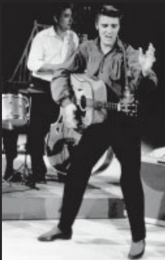
America's first star of rock and roll, Elvis Presley, performing on television's "Ed Sullivan Show," September 9, 1956.