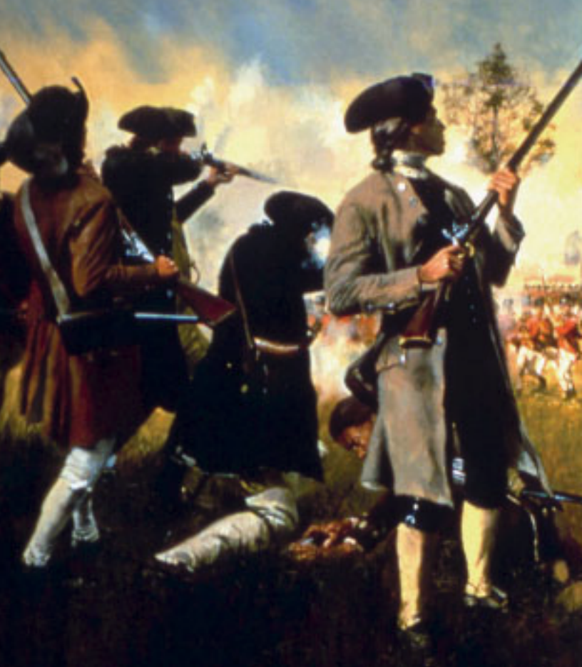
Artist's depiction of the first shots of the American Revolution, fired at Lexington, Massachusetts, on April 19, 1775. Local militia confronted British troops marching to seize colonial armaments in the nearby town of Concord.