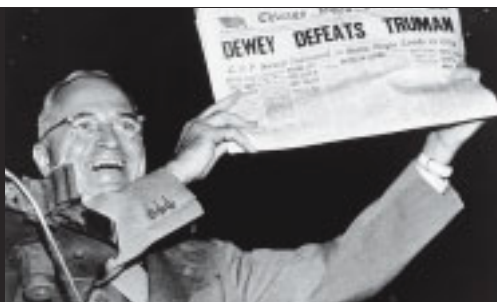
President Harry S. Truman holds a newspaper that wrongly announced his defeat by Republican candidate Thomas Dewey in the 1948 election.

Faced with a postwar world of civil wars and disintegrating empires, the United States hoped to provide the stability to make peaceful reconstruction possible. It advocated democracy and open trade, and committed $17,000 million under the “Marshall