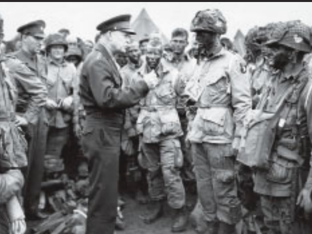
General Dwight Eisenhower, Supreme Commander in Europe, talks with paratroopers shortly before the Normandy invasion, June 6, 1944.