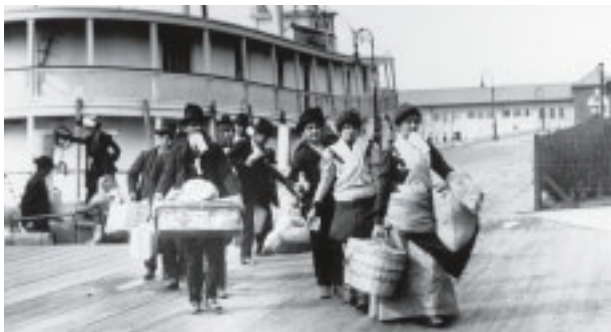
Immigrants arriving at Ellis Island in New York City, principal gateway to the United States in the late 19th and early 20th centuries. From 1890 to 1921, almost 19 million people entered the United States as immigrants.

From the time that Europeans landed on the east coast of America, their migration westward meant confrontation with native peoples. For many years, government policy had been to move Native Americans beyond the reach of the white frontier to lands reserved for their use. Time and again, however, the government ignored its agreements and opened these areas to white settlement. In the late 1800s, Sioux tribes in the northern plains and Apaches in the southwest fought back hard to