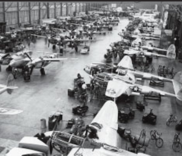
Assembly line of P-38 Lightning fighter planes during World War II. With its massive output of war materiel, the United States became, in the words of President Roosevelt, "the arsenal of democracy."