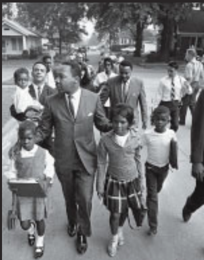
Martin Luther King Jr. escorts children to a previously all-white public school in Grenada, Mississippi, in 1966.