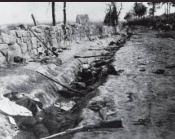
Confederate dead along a stone wall during the Chancellorsville campaign, May 1863. Victorious at Chancellorsville, Southern forces advanced north into Pennsylvania, but were defeated at the three-day battle of Gettysburg, the turning point of the Civil War and the largest battle ever fought in North America. More Americans died in the Civil War (1861-65) than in any other conflict in U.S. history.