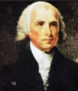
James Madison, fourth president of the United States, is often regarded as the “Father of the Constitution.” His essays in the debate over ratification of the Constitution were collected with those of Alexander Hamilton and John Jay as The Federalist Papers .