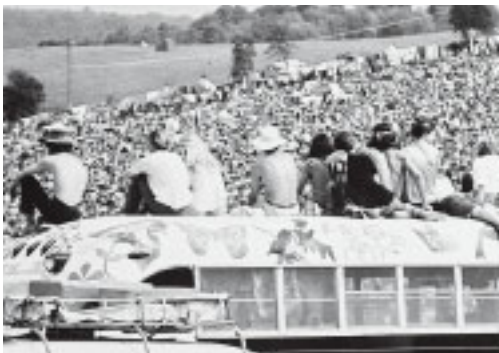
The crest of the counterculture wave in the United States: the three-day 1969 outdoor rock concert and gathering known as Woodstock.