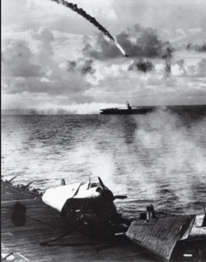
World War II in the Pacific was characterized by large-scale naval and air battles. Here, a Japanese plane plunges down in flames during an attack on a U.S. carrier fleet in the Mariana Islands, June 1944.