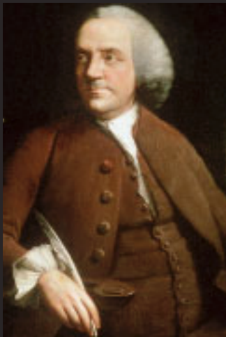
Benjamin Franklin: scientist, inventor, writer, newspaper publisher, city father of Philadelphia, diplomat, and signer of both the Declaration of Independence and the Constitution.