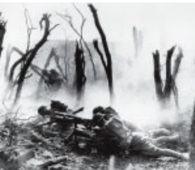
American infantry forces in 1918, firing a 37 mm. gun, advance against German positions in World War I.

The final peace treaty, however, contained virtually none of these points, as the victors insisted on harsh punishment. Wilson's idea of a League of Nations remained in the Treaty of Versailles, but even he was unable to gain enough support for the concept, and the United States rejected it. America reverted to its instinctive isolationism.