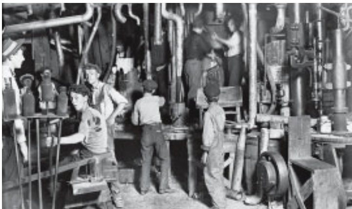
Children working at the Indiana Glass Works in 1908. Enacting child labor laws was one of the principal goals of the Progressive movement in this era.

The United States has always been a “melting pot” of nationalities, and for 300 years few restrictions were placed