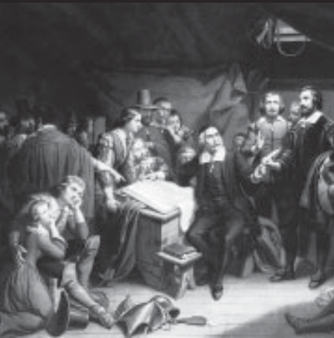
Pilgrims signing the Mayflower Compact aboard ship, 1620.