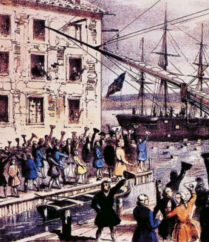
The protest against British taxes known as the "Boston Tea Party," 1773.